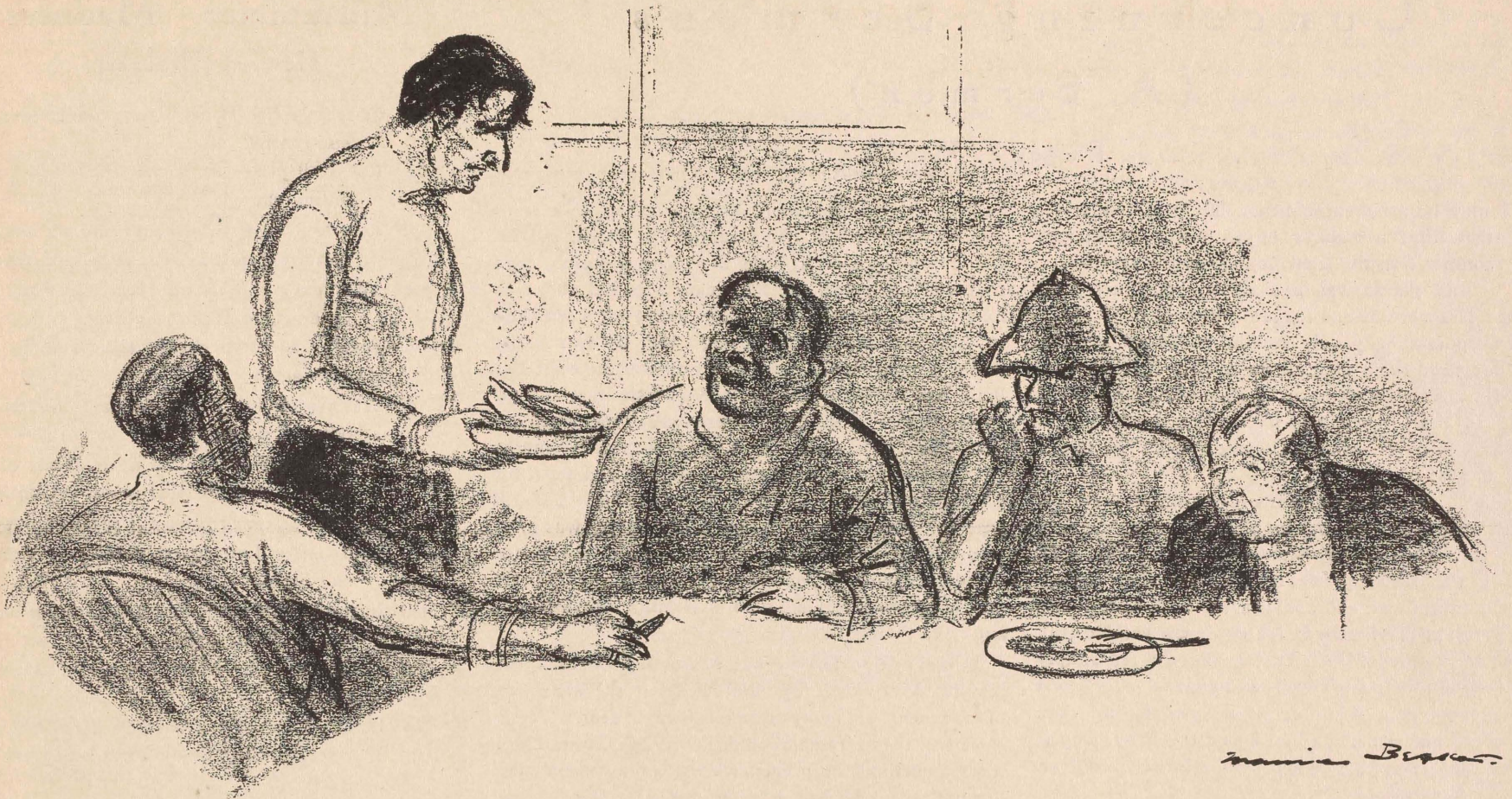
Drawn by Maurice Becker.