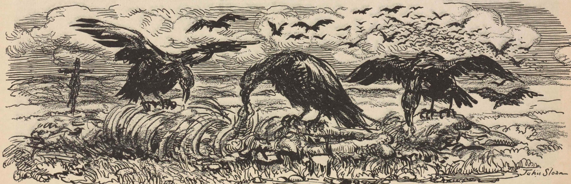
THE COMMON CROWS