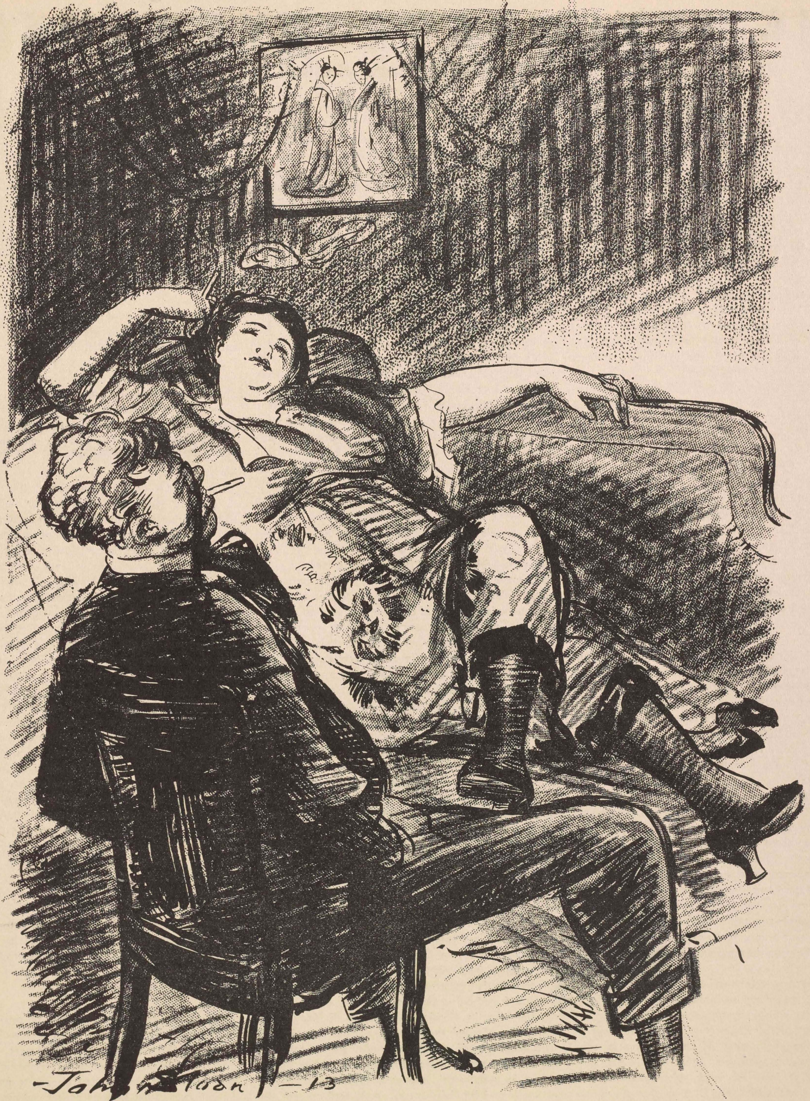
Drawn by John Sloan.