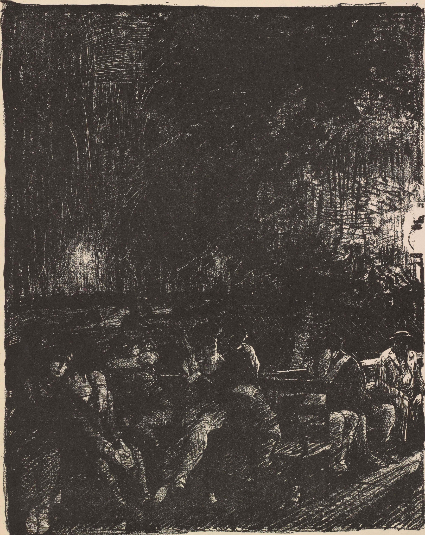
Drawn by George Bellows.