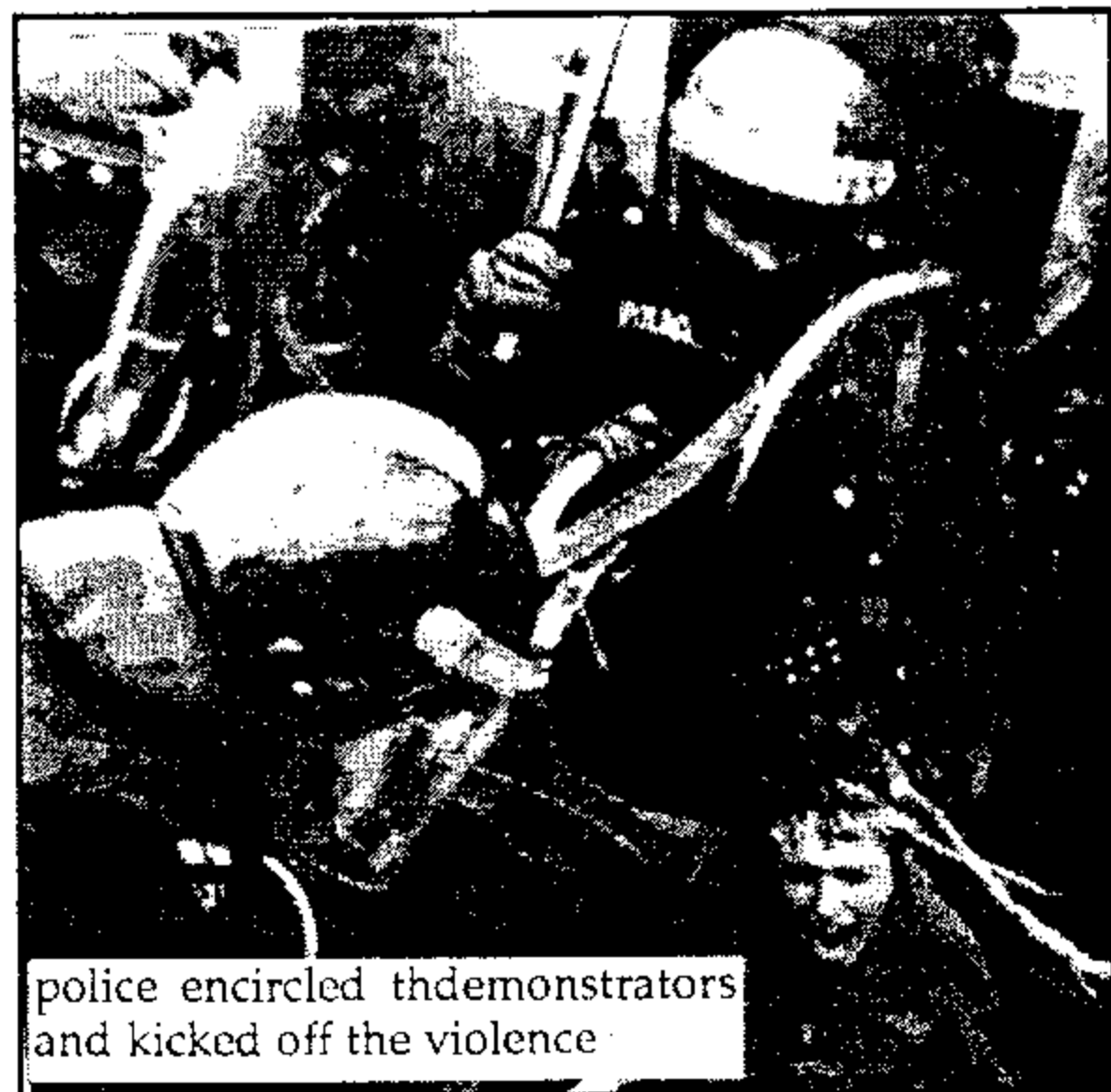
police encircled the demonstrators and kicked off the violence

First of all, who knew what our aim was? Look at Guerilla Gardening. The majority of people on the action simply had a leaflet saying "Do