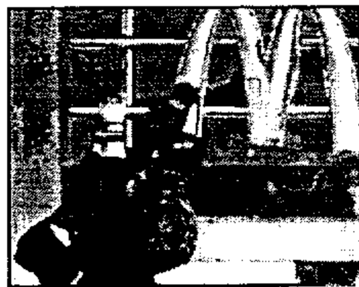
trashing MacDonalds: the right goal, or an own goal?

Special Brew in their hand screaming "Who appointed you the demo police". It's just one individual versus another, with no larger collective goal.