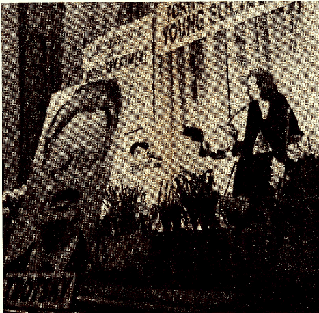
Behind the portrait of Trotsky a delegate speaks from the platform to the conference. The fact that youth could sit for eight hours in a smoke-filled conference hall and listen quietly to serious political discussion of socialist policies astounded the capitalist press.

While admitting all the monstrous charges put to him by prosecutor Vyshinsky, the former White Guard, Bukharin managed to use his testimony to the court to signal his innocence to the world.